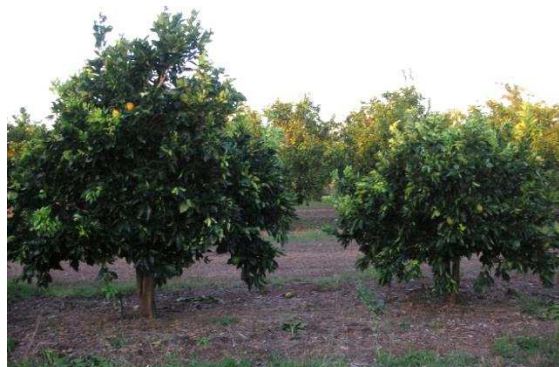
A healthy sweet orange tree (L) and one infected with orange stem pitting (R)

Do not move citrus propagation material from Queensland to other states to avoid spreading ORANGE STEM PITTING