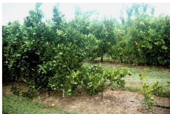
Scions infected with tatterleaf virus on tolerant (L) and susceptible (R) rootstocks

Citrus tatterleaf virus : This virus causes stunting and chlorosis in infected scions when grafted onto susceptible rootstocks such as Citrus (Poncirus) trifoliata , citrange or Swingle citrumelo. A yellow ring is seen at the bud union of symptomatic trees and may be mistaken for horticultural incompatibility.